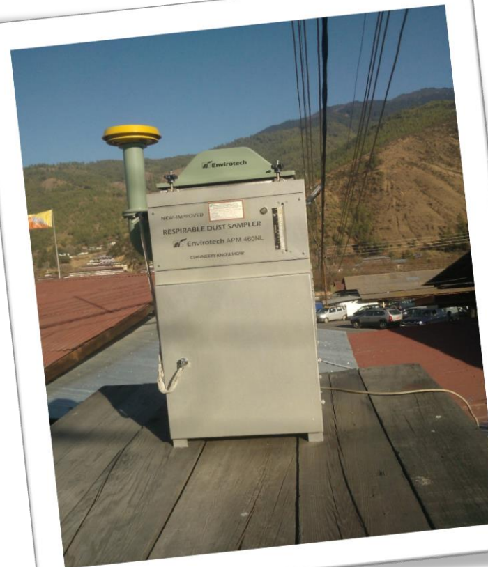
NEC Roof top