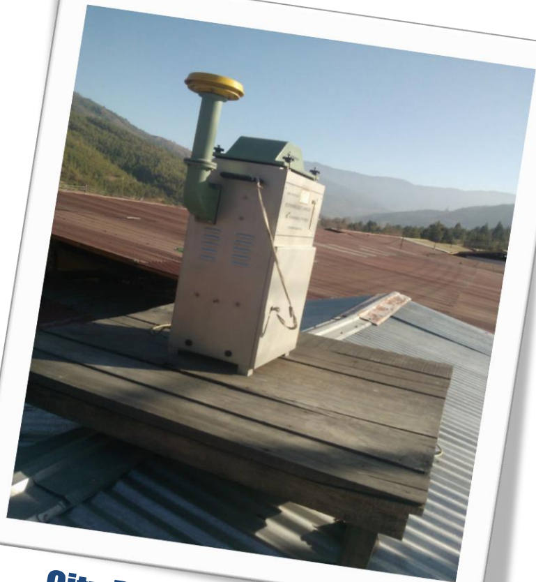
City Police Station